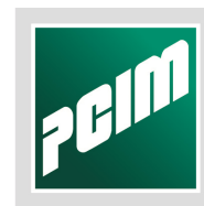
Table of Content PCIM Europe 2014