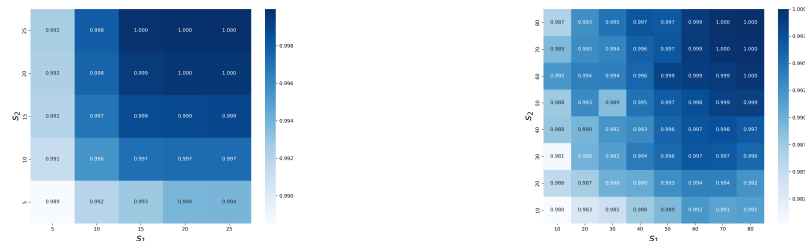
Figure 1: On UCI data with n, m = 28, 29

In this subsection, we apply the local search algorithm to evaluating the performance of SCCA against different sparsity levels s_1 and s_2 . Specifically, for a given dataset, we compute the ratio of correlations between SCCA and CCA for various s_1, s_2 parameters. We test the real UCI data and synthetic data, and the results are displayed in Figure 1 and Figure 2. This visualization provides insights for the maximum sparsity SCCA can achieve while maintaining the correlation of full data. For the real UCI data, SCCA almost recovers the correlation of CCA when s_1 \approx n/2 and s_2 \approx m/2 .